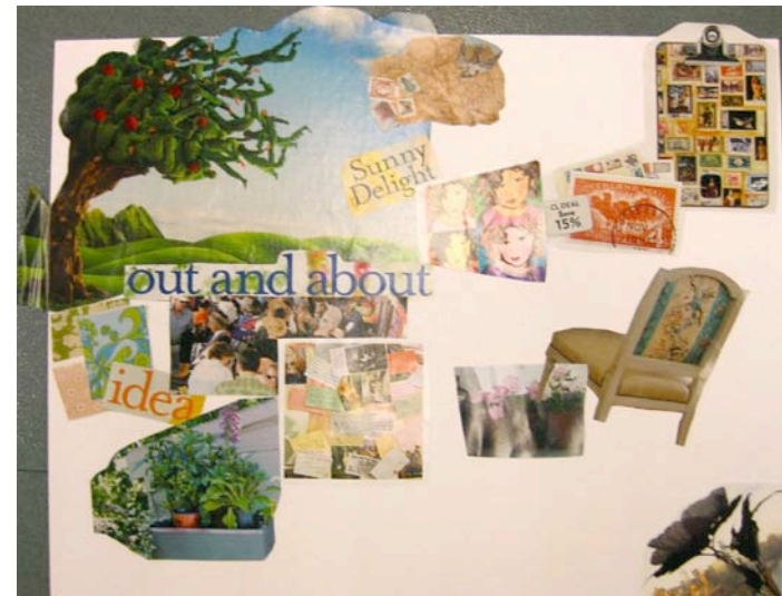
Inspiration board for the final piece

Once I found the right beads, I got the idea right away. Narrowing down to less beads gave me clarity. Once I received the little beads that I was eyeing, I knew exactly what to do. I love colors – peaceful happy colors. Try to flow, don't get frustrated right away.