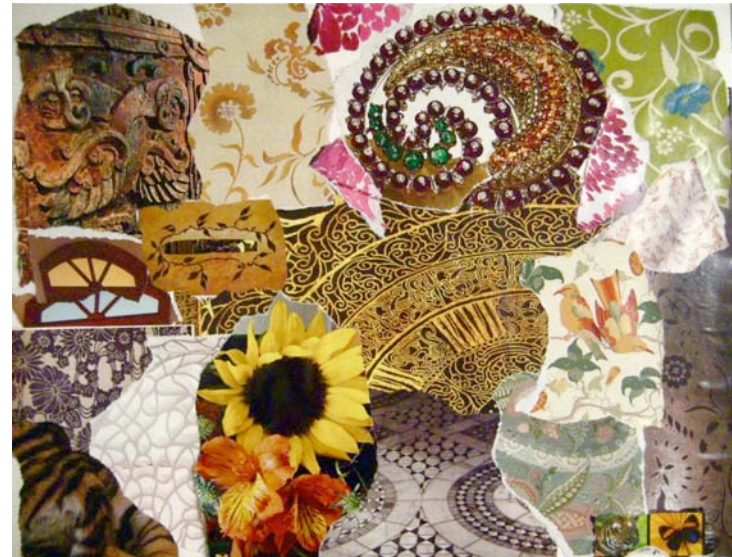
Inspiration board for the final piece

Learning color combination of crystal beads to create a cohesive design