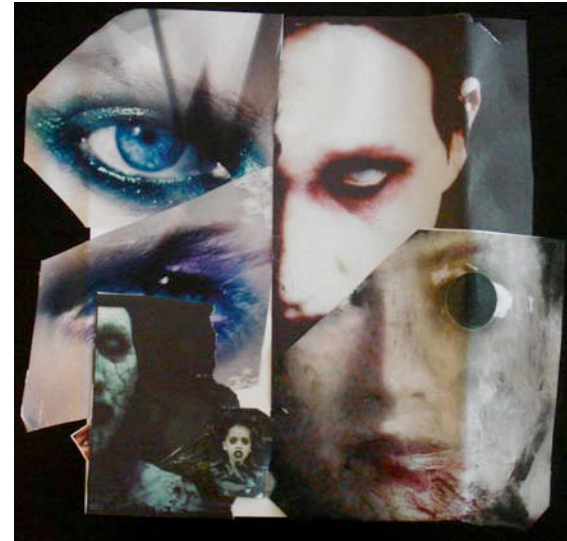
Inspiration board for the final piece

The hands on process is always a challenge; needing to make choices between what is to be excluded and what is included