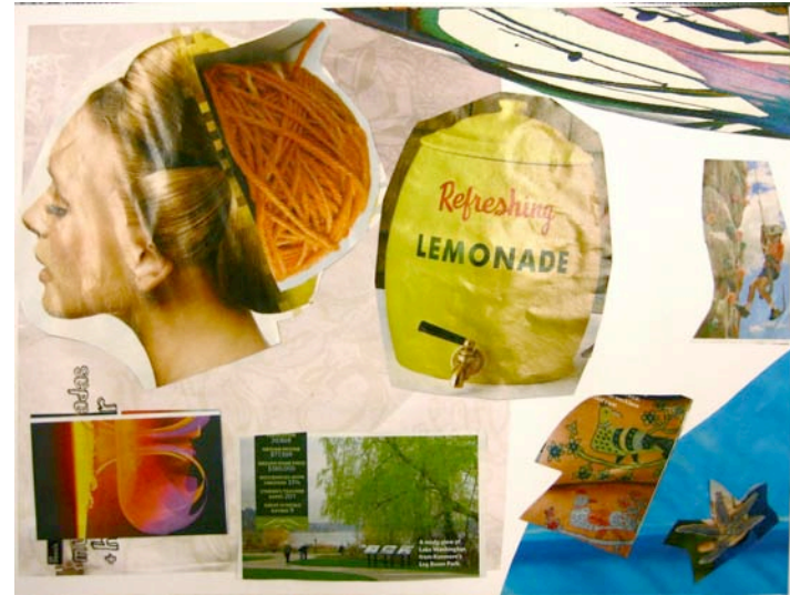
Inspiration board for the final piece