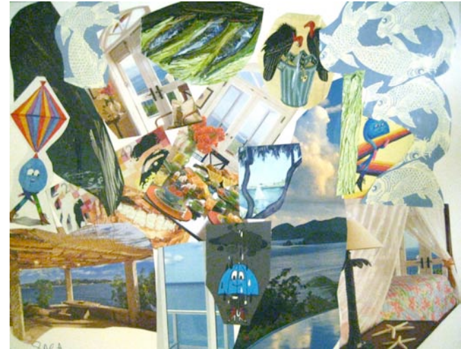
Inspiration board for the final piece

I very much enjoyed the creative dialogue that evolved into the final piece.