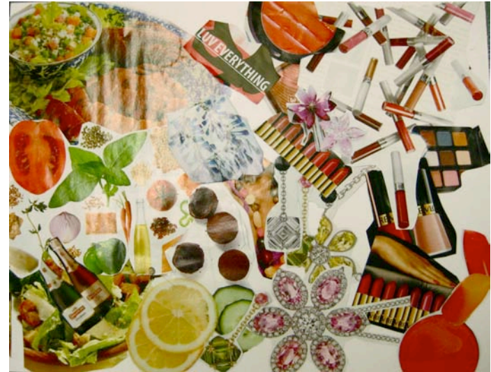
Inspiration board for the final piece

I found out it is easier to make 3-4 strands twisted with wire instead of struggling with cord/string. I always had a difficult time working with wire.