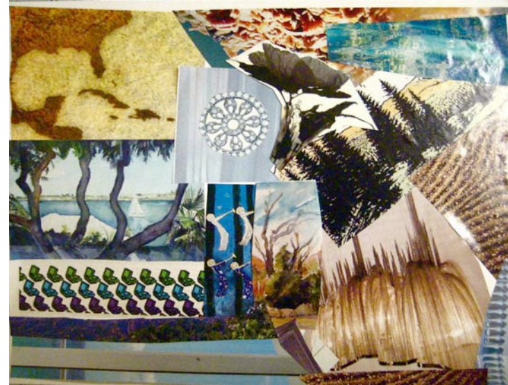
Inspiration board for the final piece

There were many surprises due to the incorporation of the ideas Maggie had printed for me. I used a part of each bracelet but changed it to blend with the enamel bead I made as the center focus and my taste level. The ring inspiration came from two cabochon quartz stones with inclusions--using both stones on one ring shaft that I picked and just using a simple bezel to set them.