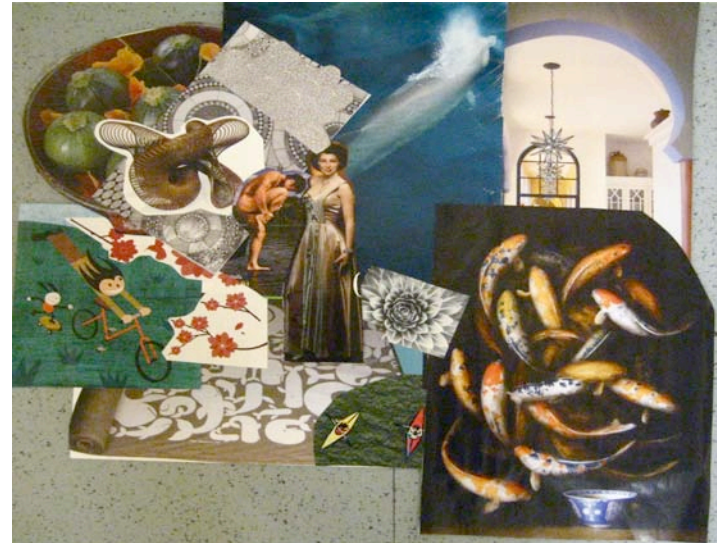
Inspiration board for the final piece

If it could speak it would say: Everything is change.