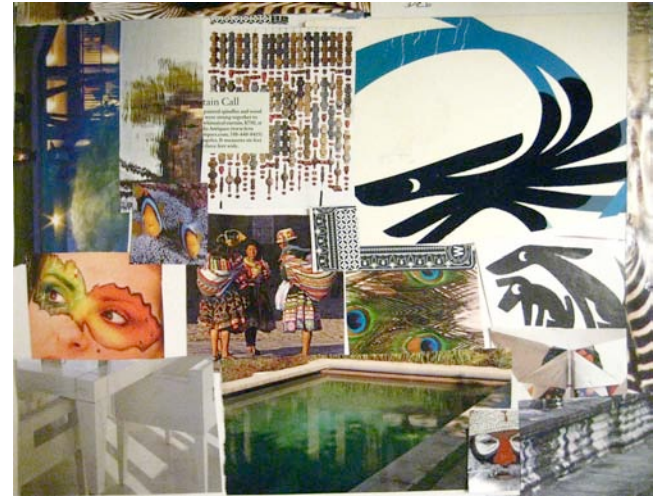
Inspiration board for the final piece

I love working collaboratively – it helps me challenge my own thinking and creativity. I like working with material I can mold with my hands, i.e. the mesh silver.