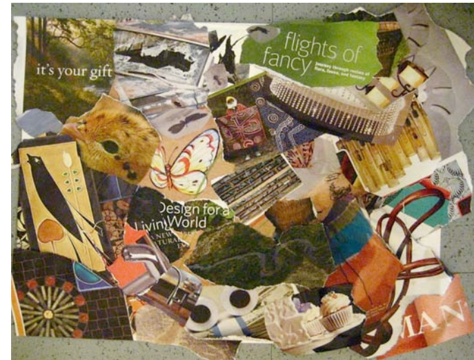
Inspiration board for the final piece

Working with natural things like leaves that deteriorate was a challenge to overcome.