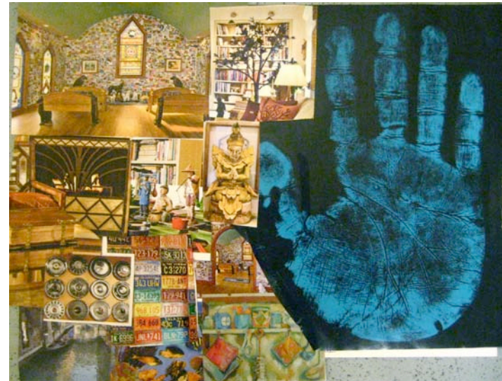
Inspiration board for the final piece

Lots of fun – playful. I enjoyed looking at images, collaging them, and seeing how they transform concepts and ideas.