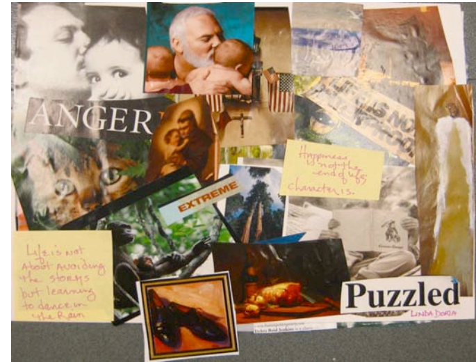
Inspiration board for the final piece